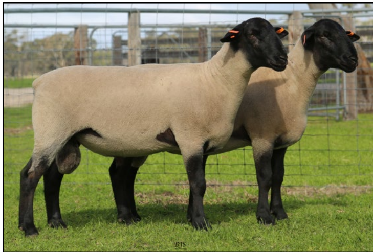
Lots 34 and 35